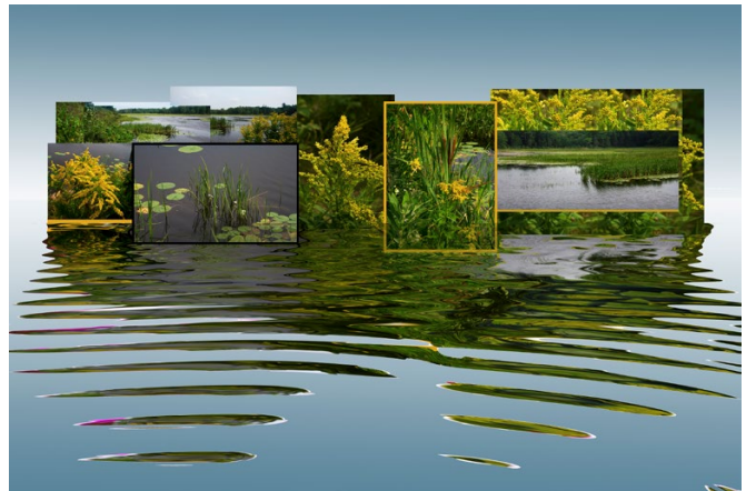
2-Jeane Kat McGrail Golden Opulence, from the The River Project: Origin, Movement, Confluence—Reflection Series

26" x 22" Digital Photo Assemblage ©2009