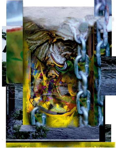
1-Jeane Kat McGrail Boat Wasps I, from The River Project Origin, Movement, Confluence—Convergence-Series

26" x 22" Digital Photo Assemblage ©2009